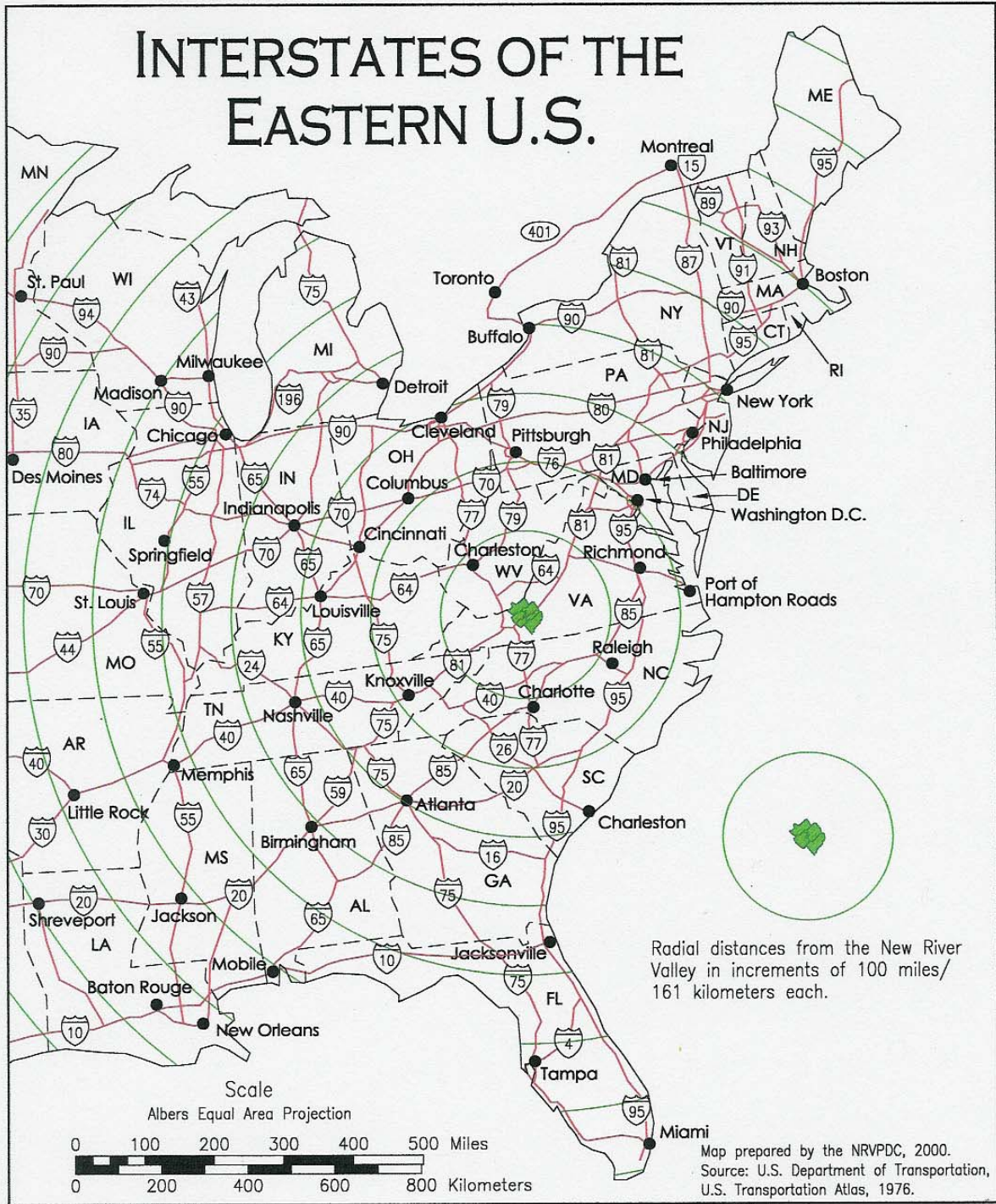
Figure 25 Interstates of the Eastern United States