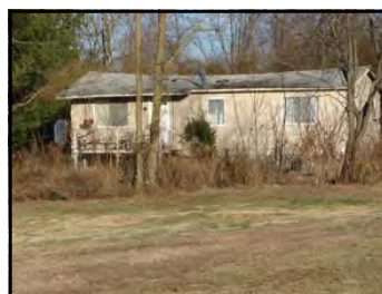
Pictured above: Potential Housing Rehabilitation Beneficiaries